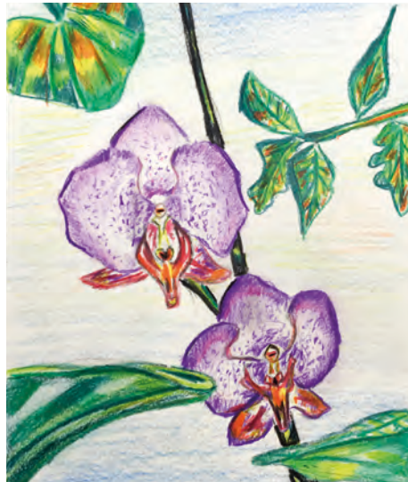
Sophia Cochrane, LIV