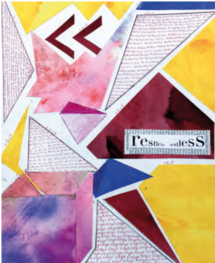
Kamila Abdulhamidova, III