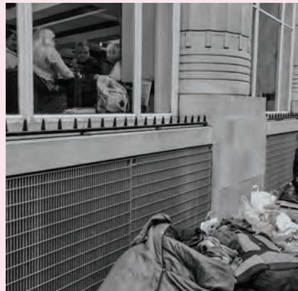
Delaney Grey (Saturn) People Category Winner