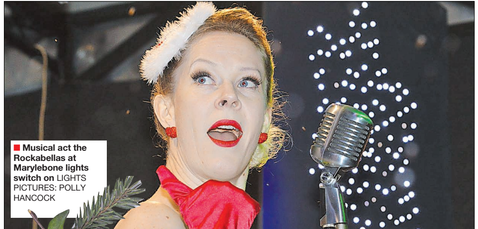
■ Musical act the Rockabellas at Marylebone lights switch on LIGHTS