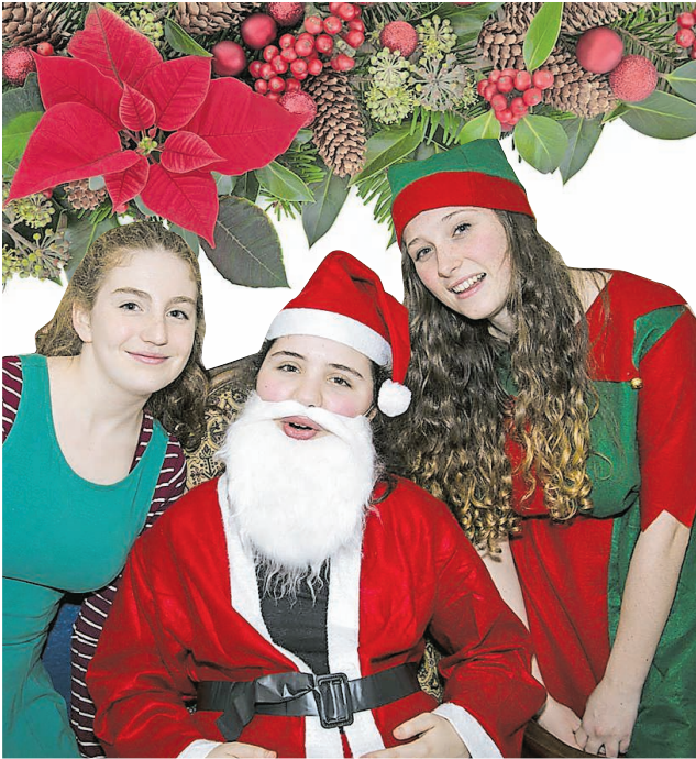
■ Father Christmas at Francis Holland's fair