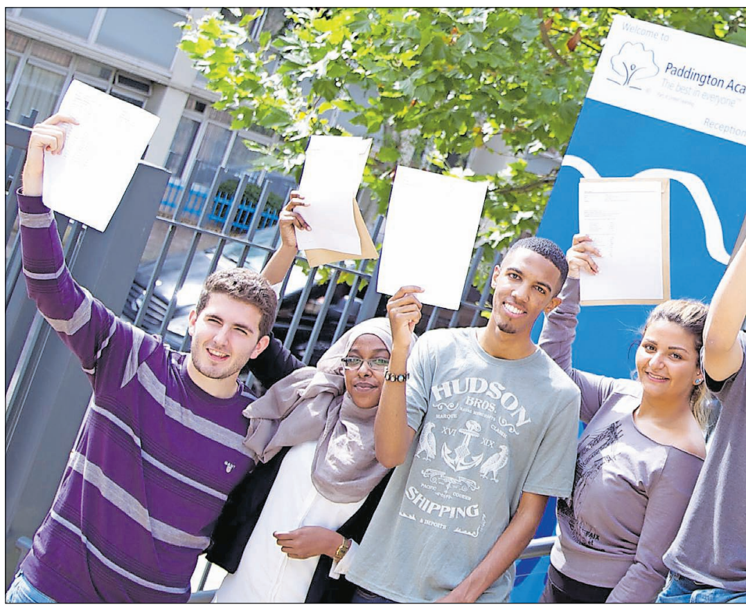
■ Delighted students from Paddington Academy clutch their A-level results